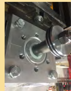
Features #5 and #6